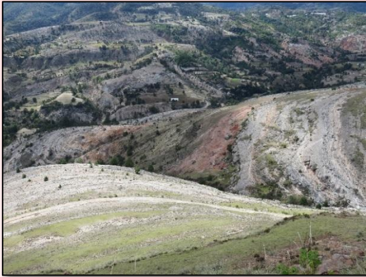
Viewpoint of the eastern slope of the Cerro del Sol

Another attraction of the Cerro del Sol, called Yucunchi in Mixteco, are panoramic views; strata of the different types of rocks and lithologic contacts affected by the activity of regional faults can be seen .